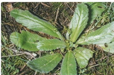
Flowering plant. Photographer Sue Guymr, east of Melbourne