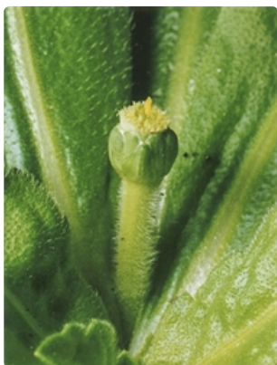
Flower head. east of Melbourne