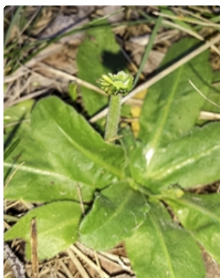
Seedling plant. Photographer Russell Best, north of Sunbury, Vic