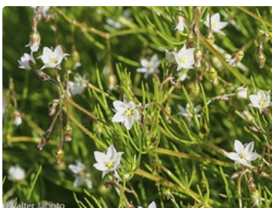
Flowering stems. Photographer Valter Jacinto, Portugal