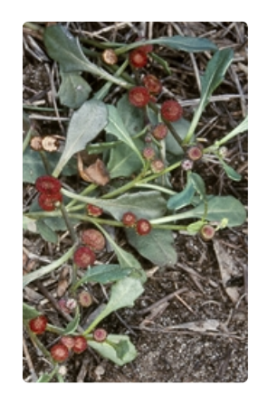
Spent flowers and leaves.