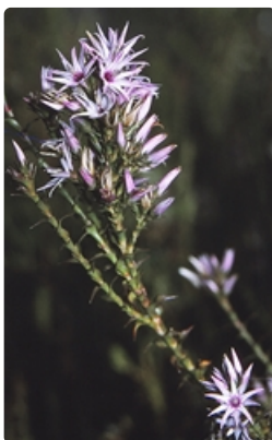
Flowering stem. Booderee National Park, Jervis Bay Territory