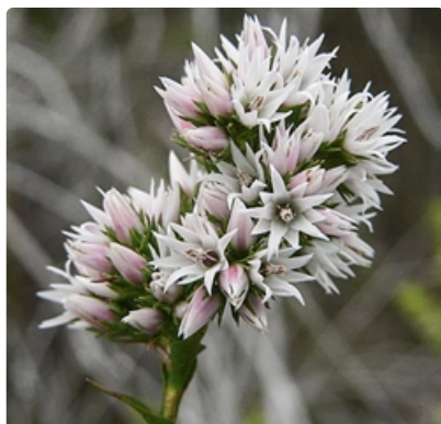
Flower cluster.