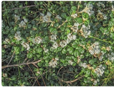
Flower clusters and leaves.