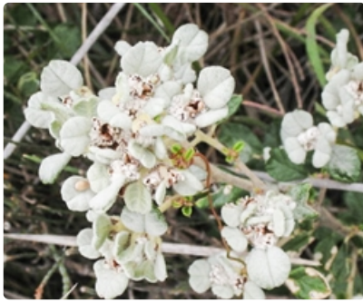
Flower clusters.