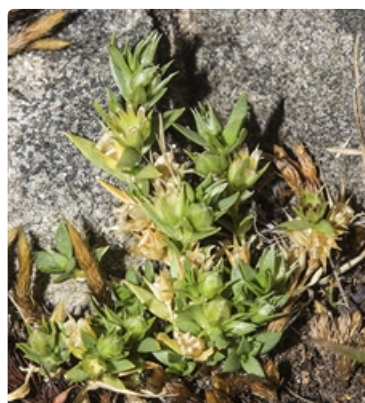
Plants (subsp. multiflora ).