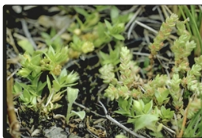
Plants (subsp. multiflora ). Australian Plant Image Index, photographer Colin Totterdell, Kosciuszko National Park