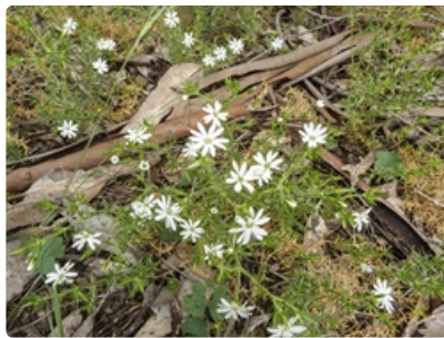
Flowering plants. Black Mountain, Canberra, ACT