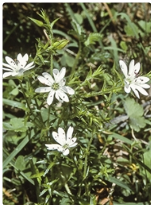
Flowers and leaves. Photographer Don Wood, Wadbilliga National Park