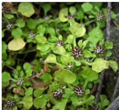
Flowering plants. Australian Plant Image Index, photographer AN Schmidt-Lebuhn, Koorawatha Nature Reserve south of Cowra