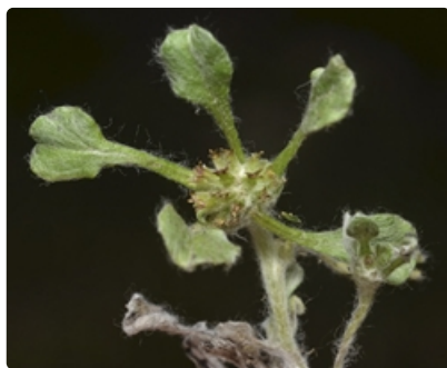
Flower head. Black Mountain Reserve, Canberra, ACT