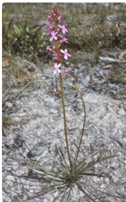
Flowering plant. Jervis Bay, NSW