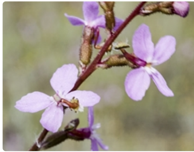
Flowers. Australian Plant Image Index, photographer Murray Fagg, Gundry Grassland Reserve near Goulburn