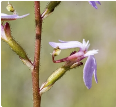
Flower. Gundry Grassland Reserve near Goulburn