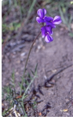
Flowering plant. Photographer Don Wood, Conder, Canberra, ACT