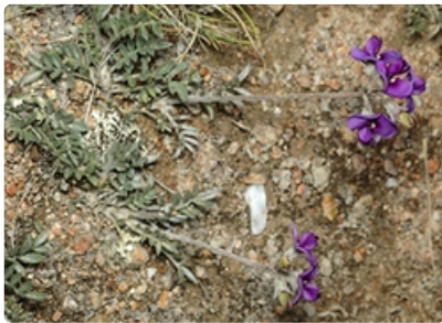
Flowering plants. Scottsdale Bush Heritage Reserve near Bredbo