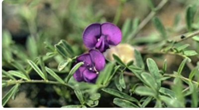
Flowers and leaves. Australian Plant Image Index, photographer Murray Fagg, Naas Valley, ACT