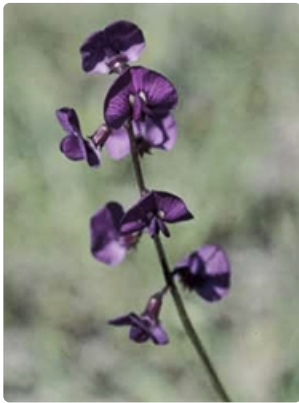
Flowers. Aranda, Canberra, ACT