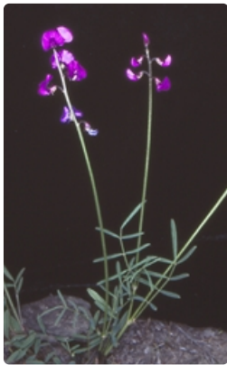
Flowering plant. Caswell Drive rural lease, Canberra, ACT