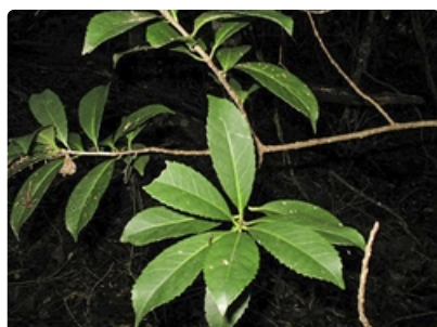
Leafy stems.