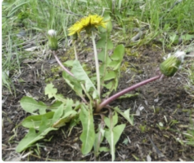
Flowering plant. Photographer Don Wood, suburban lawn, Canberra, ACT