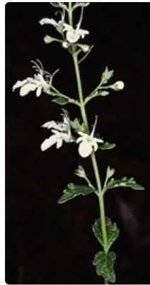
Flowering stem Gulaga National Park near Tilba Tilba