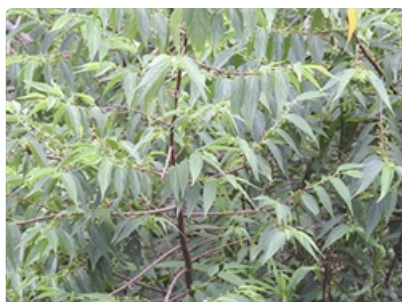
Shrub. Brogo, north of Bega