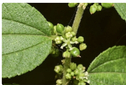
Flowering and fruiting stem