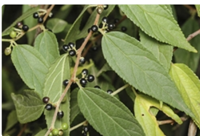
Fruiting stem