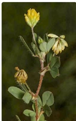
Flowering stem. Australian Plant Image Index, photographer Murray Fagg, Black Mountain, Canberra, ACT