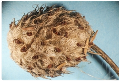
Seed case. Photographer Zoya Akulova, California, USA