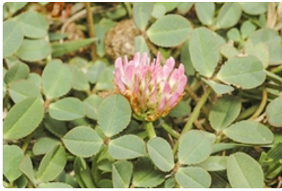
Flower and leaves. Jerrabomberra Wetlands, Canberra, ACT