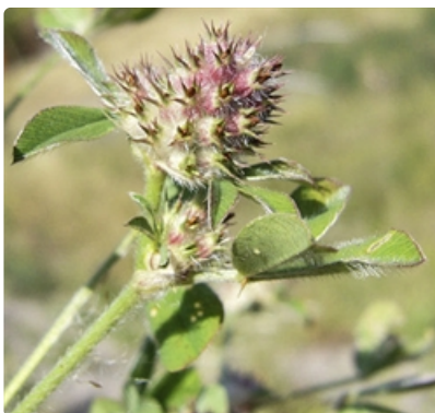
Seed case and leaves.