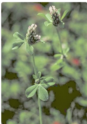
Flowering stems. Australian Plant Image Index, photographer Murray Fagg, Mulligans Flat Nature Reserve, ACT