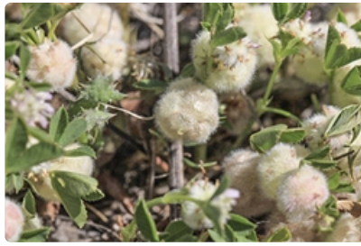
Seeding stems.