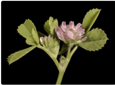
Flower head and leaves.