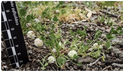
Seeding plant.