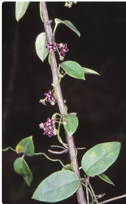
Flowering stem Boyne State Forest, north east of Nelligen