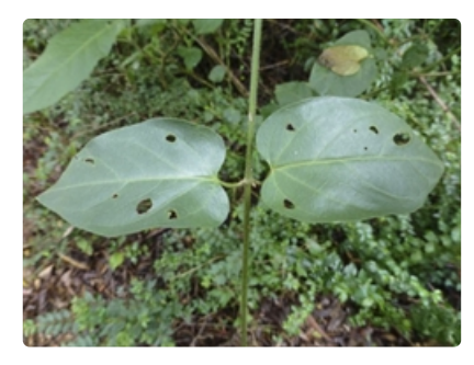
Leaves on stem north of Taree.