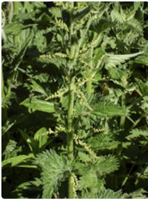
Flowering stem