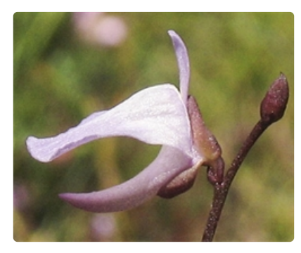
Flow er.