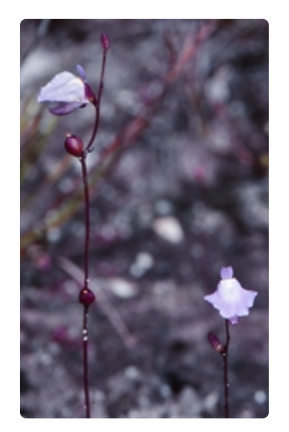
Flow ering stems. Jervis Bay, NSW