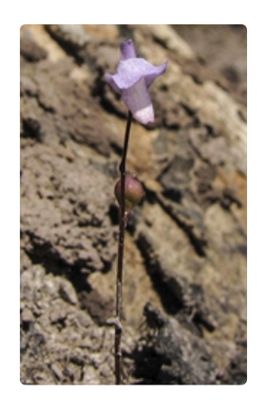
Rowering stem.