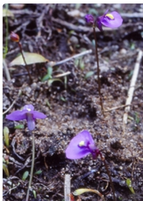
Flowering stems. Photographer Don Wood, South East Forests National Park