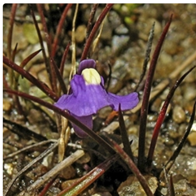
Flowering plant. Photographer Jackie Miles, Kosciuszko National Park