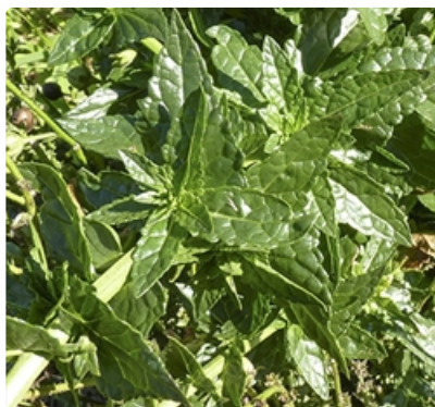
Leaves.