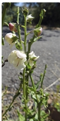
Flowering stem. Tidbinbilla Nature Reserve, ACT