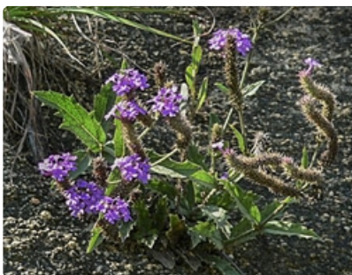
Flowering plants.