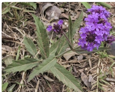
Flowering plant.