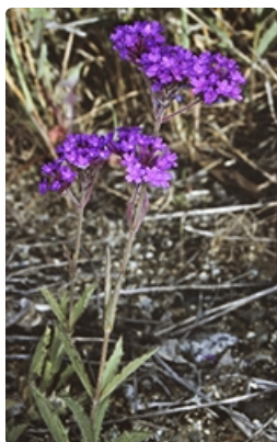
Flowering plants. near Bega