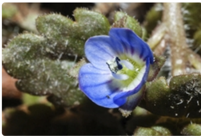
Flower and leafy bract. Photographer Ron Thomas, Arkansas, USA