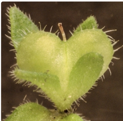
Seed case.