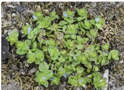
Plant. Photographer JC Schou, Denmark