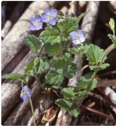
Flowering plant. Tallaganda State Forest south of Braidwood