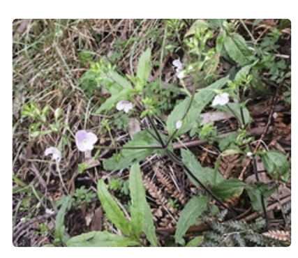
Flow ering plant. Baw Baw National Park, Vic