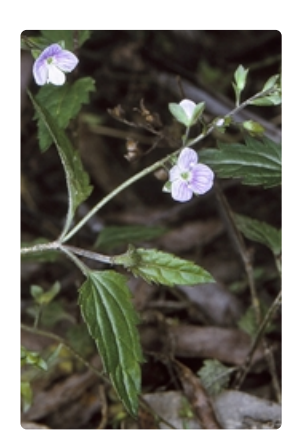
Flow ering stem. Deua National Park