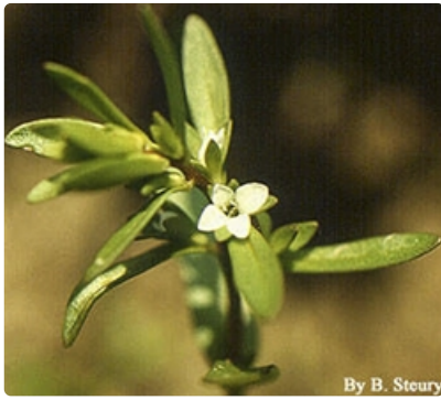
Flower and leaves.