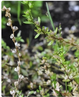
Stems with seed cases.