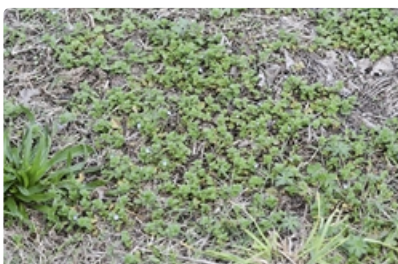
Carpet. Australian Plant Image Index, photographer Murray Fagg, Exeter, NSW