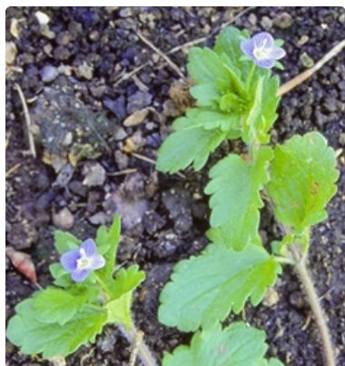
Flowering stems. garden, Weetangera, Canberra, ACT