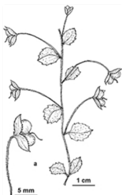
Line drawings. g, seeding branch; seed case. S Clark, National Herbarium of Victoria, © 2021 Royal Botanic Gardens Board