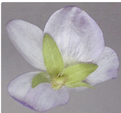
Back of flower.