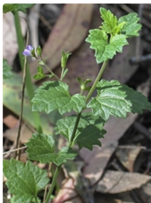
Leafy stem with flower.