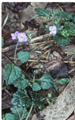
Flowering stems. Bungonia State Conservation Reserve