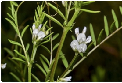
Flowers and leaves. between Cobram and Barroga, Victorian bank of Murray River, Vic