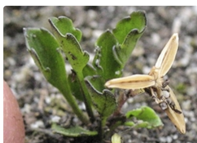
Plant with open seed case.