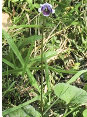
Flowering plant.