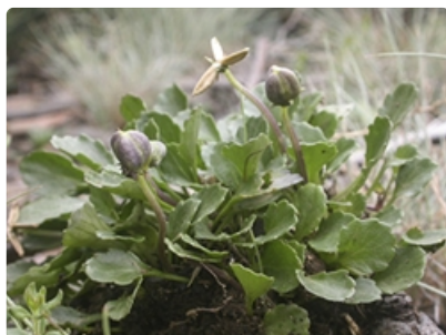
Flowering plant.