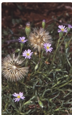
Flowering and seeding plant. Coolangobra State Forest near Bombala