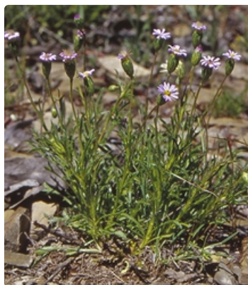
Flowering plant. Mulligans Flat Nature Reserve, ACT