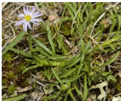
Flowering plant. Scottsdale Bush Heritage Reserve near Bredbo