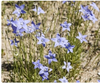
Flowering plants. Australian Plant Image Index, photographer Murray Fagg, Condobolin