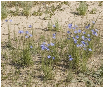
Flowering plants. Condobolin