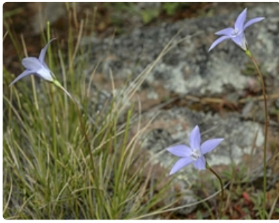
Flowering plant. Scottsdale Bush Heritage Reserve near Bredbo