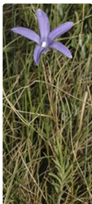
Flowering stem. Australian Plant Image Index, photographer Murray Fagg, Kosciuszko National Park