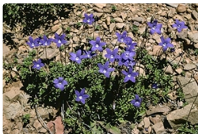
Flowering plant. Australian Plant Image Index, photographer Murray Fagg, Namadgi National Park, ACT