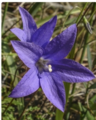
Flowers.