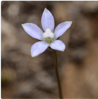
Flower. Australian Plant Image Index, photographer Murray Fagg, Scottsdale Bush Heritage Reserve near Bredbo