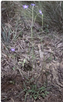
Flowering plant. Photographer Don Wood, east of Braidwood