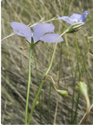
Flower and bud.