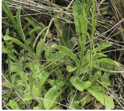
Leafy stems.