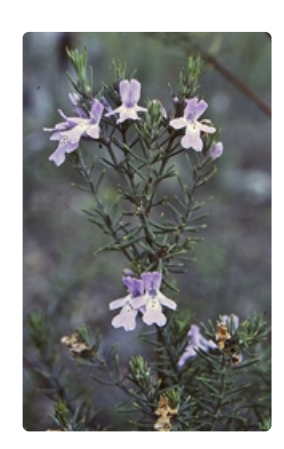
Flow ering stems. Bungonia State Conservation Area east of Goulburn