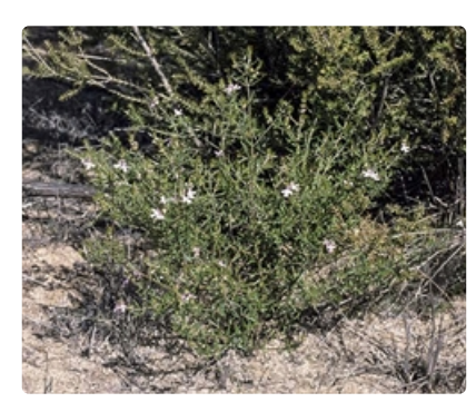
Flow ering shrub. Australian Plant Image Index, photographer Joe McAuliffe, Big Desert National Park,