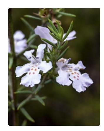
Flowering stem Goobang National Park east of Parkes