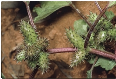
Stem with burrs.