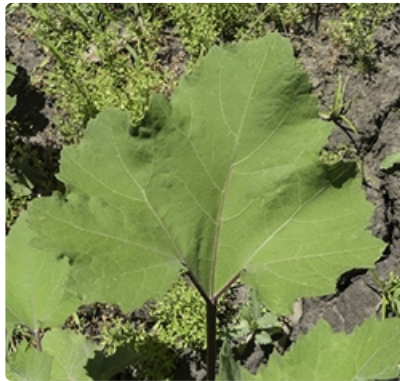
Leaf.