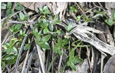
Plant. Wilsons Promontory National Park, Vic