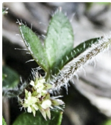
Flowers and leaf. Wilsons Promontory National Park, Vic