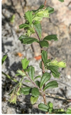
Flowering stems.