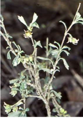
Flowering stems. Kioloa State Forest north of Batemans Bay