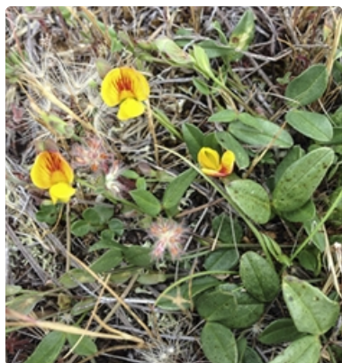
Flowering stems. Jerrabomberra, ACT