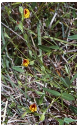
Flowering plant. north of Bega