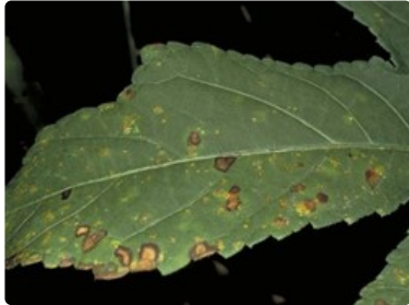
Photo 1. Spots, round to irregular with wide dark margins, on the upper surface of bele caused by leaf mould, Pseudocercospora abelmoschi .