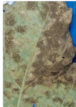
Photo 4. Leaf mould, Pseudocercospora abelmoschi . Patches joining together and forming spores on the underside of an okra leaf.