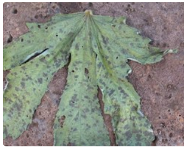
Photo 3. Upper surface of okra leaf showing dark patches of Pseudocercospora abelmoschi .