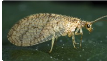
Photo 2. Brown lacewing adult, Micromus sp.