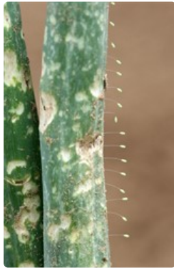
Photo 3. Group of lacewing eggs, Chrysoperla sp., fastened to a side of a branch.