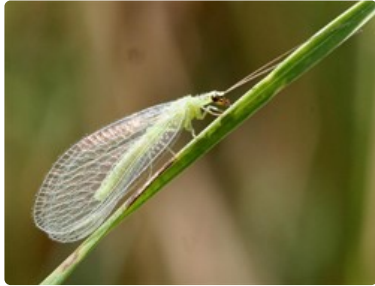
Photo 1. Green lacewing adult, Chrysoperla sp.