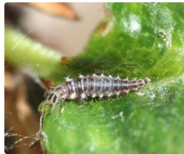
Photo 4. Larva of a green lacewing. Note the stiff hairs along the sides, and the protruding pincer-like mouth parts.