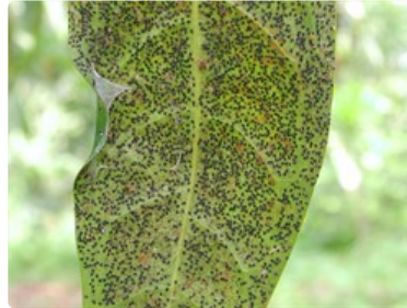
Photo 2. Underside of citrus leaf infested by orange spiny whitefly, Aleurocanthus spiniferus .