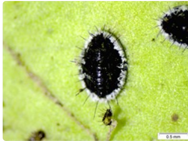
Photo 3. Pupa of the orange spiny whitefly, Aleurocanthus spiniferus . Note the white fringe of wax on the margin.