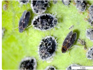
Photo 4. Pupae and newly hatched adults of the orange spiny whitefly, Aleurocanthus spiniferus .